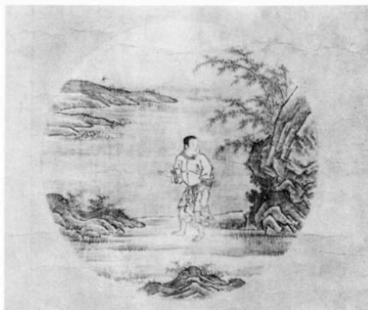
【第一 尋牛】 未熟な私に、「喜び」に満ちて真に「学ぶ」私(=牛)を尋ねる心が生まれ、私は旅立つ。

【第二 見跡】 牛の跡がやっと見つかる。先に牛が居るに違いない。が、時にはその跡さえ見失いがちだ。