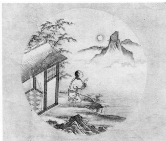
【第七 忘牛存人】 故郷に帰り着く。もはや牛に騎ることも要らない。牛を忘れ、余裕をもって自由に生きる。

obtains, manifest is the spirit of the ancient master.