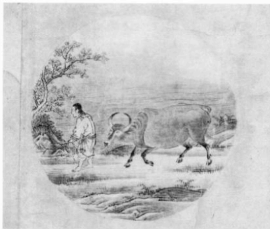
【第五 牧牛】 牛は私に親しみ、黙って静かについて 来る。もはや押さえたり追ったりすることもない。

6. Coming Home on the Ox's Back. 「騎牛帰家」 : Riding on the animal, he leisurely wends his way home: Enveloped in the evening mist, how tunefully the flute vanishes away! Singing a ditty, beating time, his heart is filled with a joy indescribable! That he is now one of those who know, need it be told?