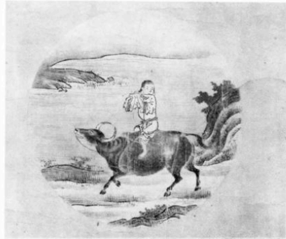
【第六 騎牛帰家】 牛と私は安心してひとつとなり、 私は牛に乗り、牛は私を騎せ、理想の故郷へと向かう。

7. The Ox Forgotten, Leaving the Man Alone. 「忘牛存人」 : Riding on the animal, he is at last back in his home, Where lo! The ox is no more; the man alone sits serenely, though the red sun is high up in the sky, he is still quietly dreaming, Under a straw-thatched roof are his whip and rope idly lying.