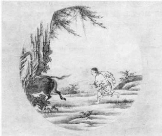
【第三 見牛】 居た居た、尋ね尋ねて来た牛が居た。 ちらとだが牛が見える。牛は確かにそこに居る。