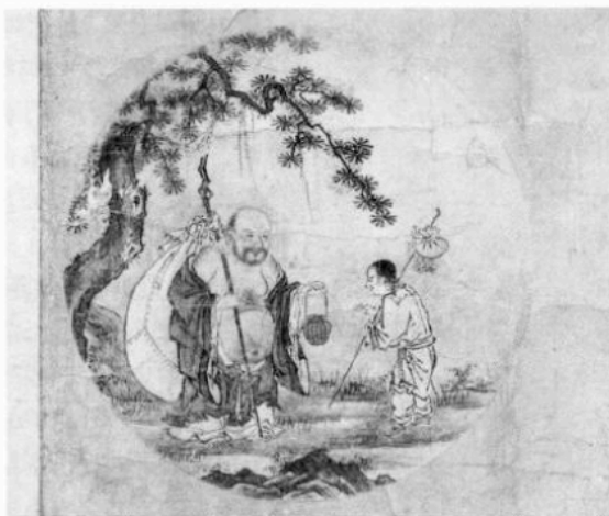
【第十 入鄴垂手】 手を垂れて、村里を訪れる。「学ぶ」に生きる私の「喜び」は、村の人々のものともなる。

Let me give a few humble comments on this. The ten symbolic pictures show the whole lifelong process of Zen discipline learning. The process is structured as the ten mutually distinguishable successive stages, from the very beginning to the end, of