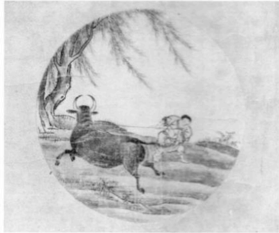
【第四 得牛】 やっと牛を捕まえる。手綱はピンと張り、 うっかりすると逃げられる。楽しくも苦しい。

5. Herding the Ox. 「牧牛」 : The boy is not to separate himself with his whip and tether, Lest the animal should wander away into a world of defilements: When the ox is properly tended to, he will grow pure and docile; Without a chain, nothing binding, he will by himself follow the oxherd.