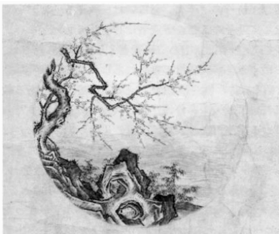
【第九 返本還源】 森羅万象が素晴らしい姿となる。総てを、永遠の今に生きる「喜び」をもって「学ぶ」。

10. Entering the City with Bliss-bestowing Hands. 「入鄴垂手」: Bare-chested and bare-footed, he comes out into the market-place; Daubed with much and ashes, how broadly he smiles! There is no need for the miraculous power of the gods, For he touches, and lo! The dead trees are in full bloom.